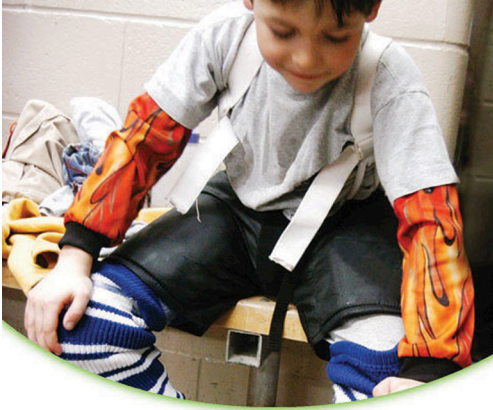
“Helping victims become children again”

Situated at 8 Forster Street, St. Catharines, Ontario the Centre opened its doors in the fall of 2008 and is the first dedicated facility of its kind in Canada.